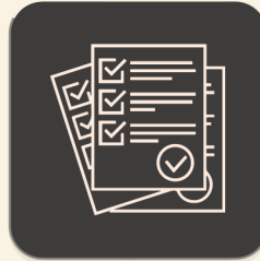
EXISTING CONTENT CURATION