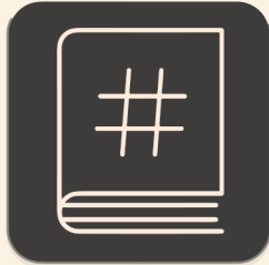
TARGETED HASHTAG LIBRARY