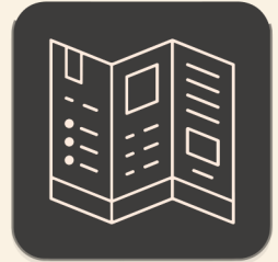
TOPICAL MAP DEVELOPMENT