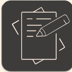
QUICK RESPONSE LIBRARY