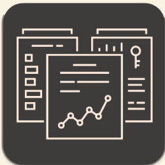
SOCIAL MEDIA AUDIT