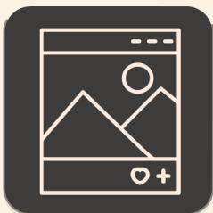
SOCIAL MEDIA POSTS