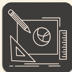
BRAND DIGITAL LIBRARY