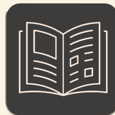
BRAND PRINT LIBRARY